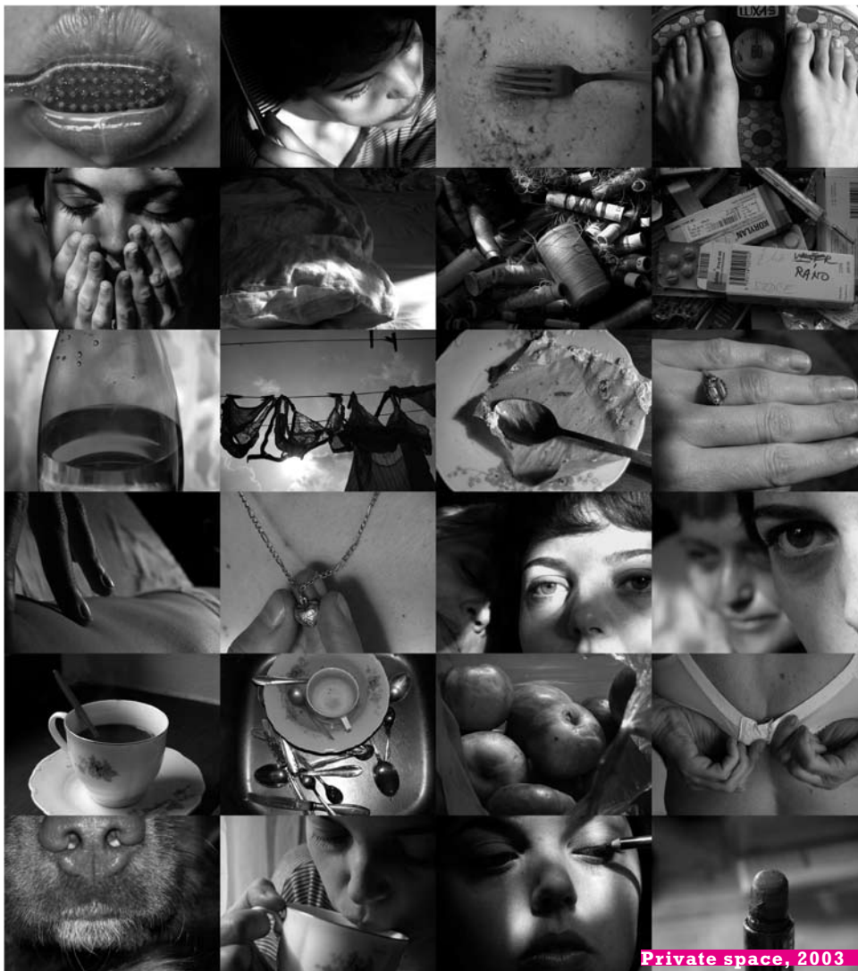
Private space, 2003