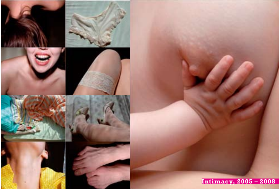
Intimacy, 2005 - 2008