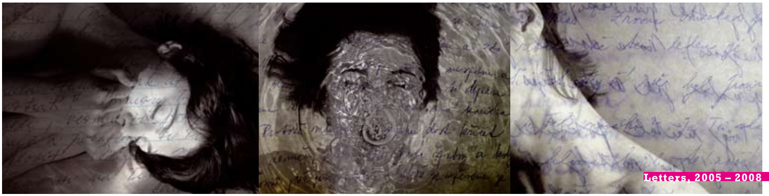
Letters, 2005 - 2008